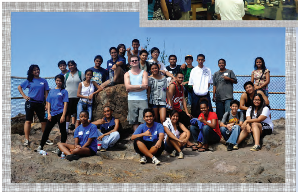
Students took part in demonstrations and presentations at the University of Hawaii's Engineering Day. They ended the day with a hike along the Ka`Iwi Scenic Shoreline.